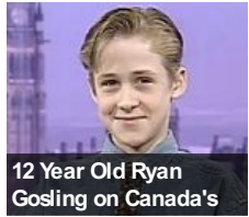
12 Year Old Ryan Gosling on Canada's