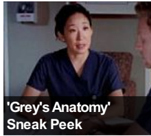
'Grey's Anatomy' Sneak Peek