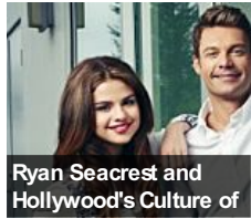
Ryan Seacrest and Hollywood's Culture of