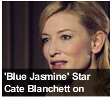
'Blue Jasmine' Star Cate Blanchett on