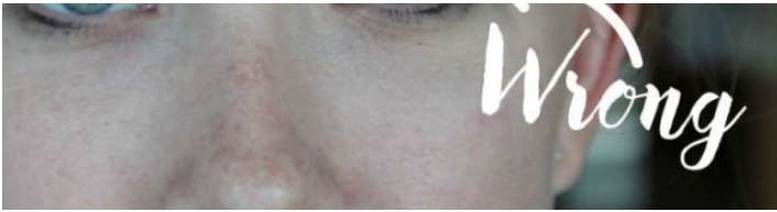
The Eyeliner Trick That Instantly Makes Your Eyes Look Wider