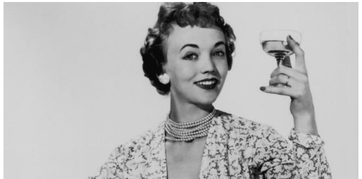
Do You Have a Wine Face?

Style Beauty kevin sands beauty school white teeth how to whiten your teeth Top 10 Most Effective Diets for 2011 Rated