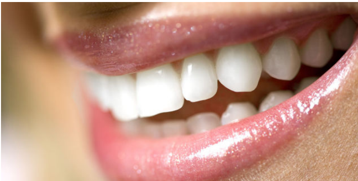
Rubbing These Two Things on Your Teeth Will Make Them Whiter in Minutes