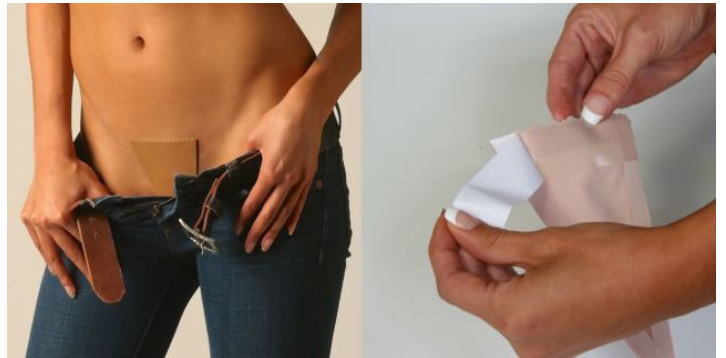
These Strapless Undies Are Just Utterly Bizarre