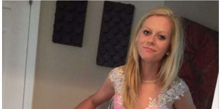
This Girl Ordered a $223 Prom Dress Online, Received "a Quilt With Arm Holes"