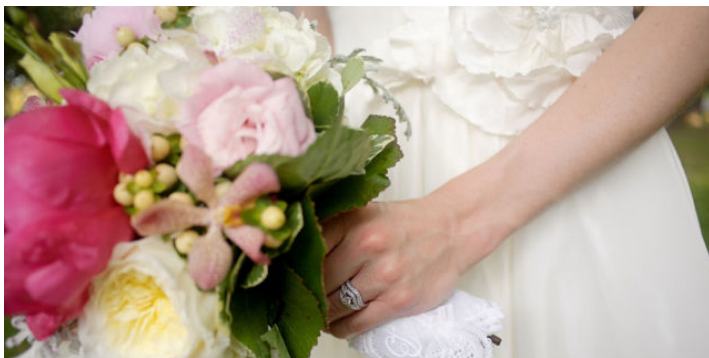
11 Wedding Dresses That Prove You Should Never Buy From Sketchy Online Retailers