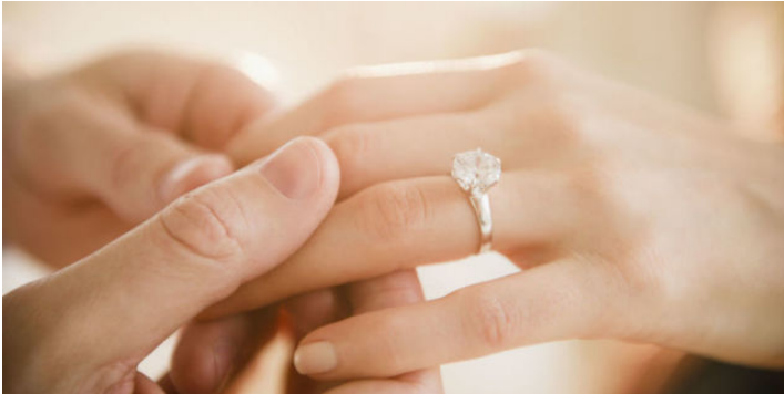
Brides Across the Country Are Furious at Kay Jewelers