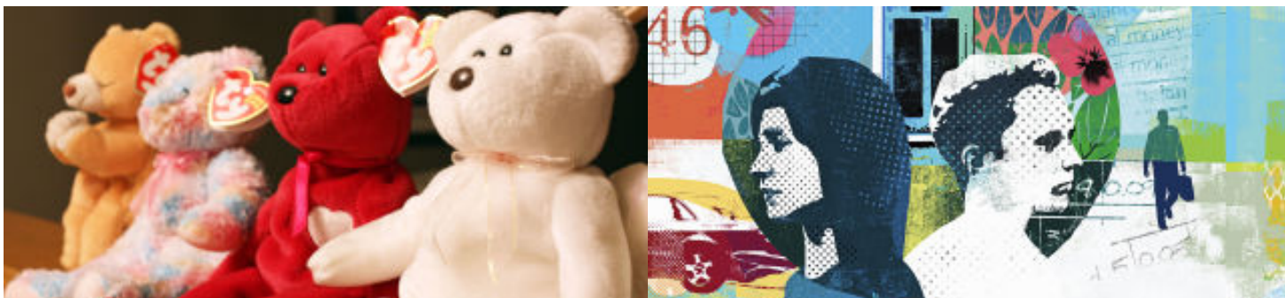
10 Things You Didn't Know About Beanie Babies