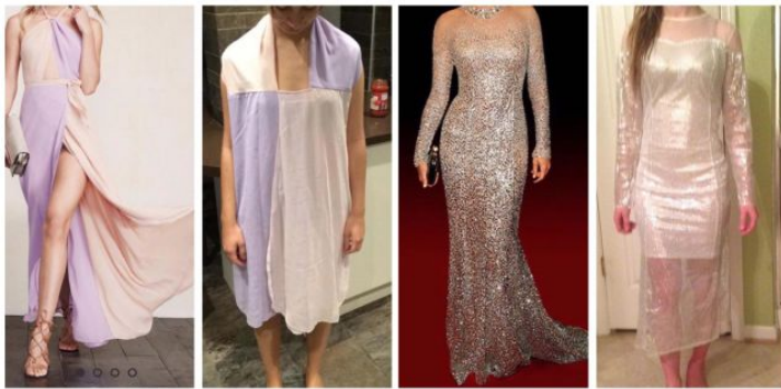
8 Online Retailers You Should Never Order From