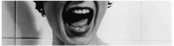
This Is How You Should Be Washing Your Vagina, According to a Doctor