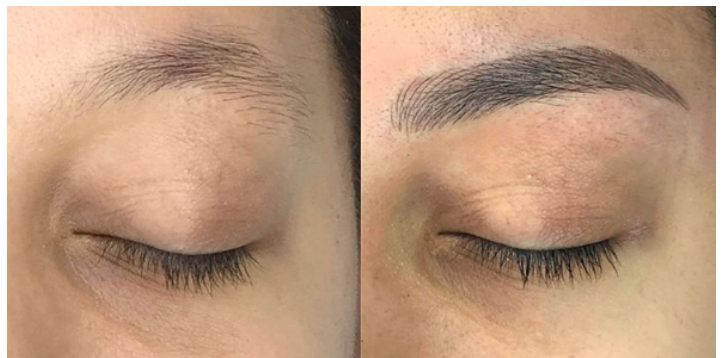
Women Across the Internet Can't Stop Talking About Eyebrow Microblading