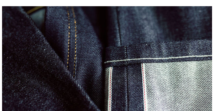
RAW SELVAGE JEANS ARE SUPPOSED TO HURT (AT FIRST)