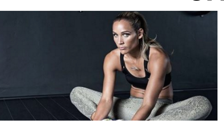
THE WOMEN WE LOVE OF INSTAGRAM: LOLO JONES