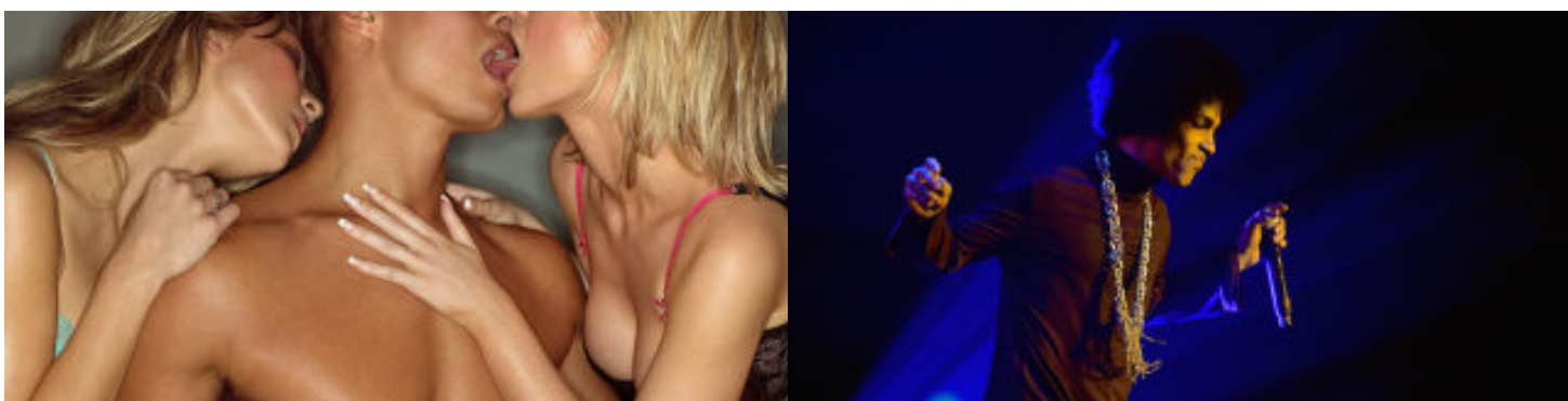
WHY I LOVE WATCHING MY HUSBAND HAVE SEX WITH OTHER WOMEN

PRINCE'S DEATH INVESTIGATION HAS TAKEN A GRIM TURN