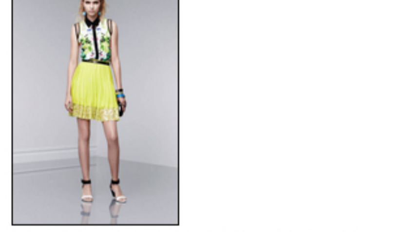
Latest Designer's Collab: Prabal Gurung for Target