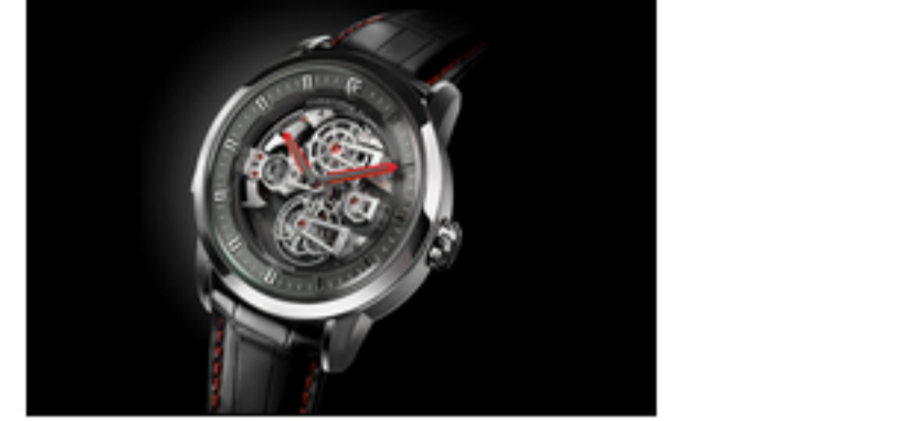
Carmelo Anthony's Haute Time Watch of the Day: Christophe Claret – The Soprano Tourbillon Minute Repeater