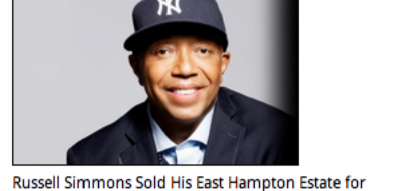
Russell Simmons Sold His East Hampton Estate for $6.995 Million