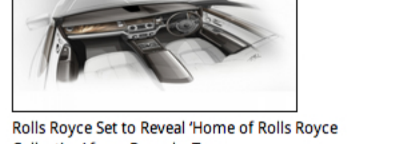
Rolls Royce Set to Reveal 'Home of Rolls Royce Collection' from Bespoke Team