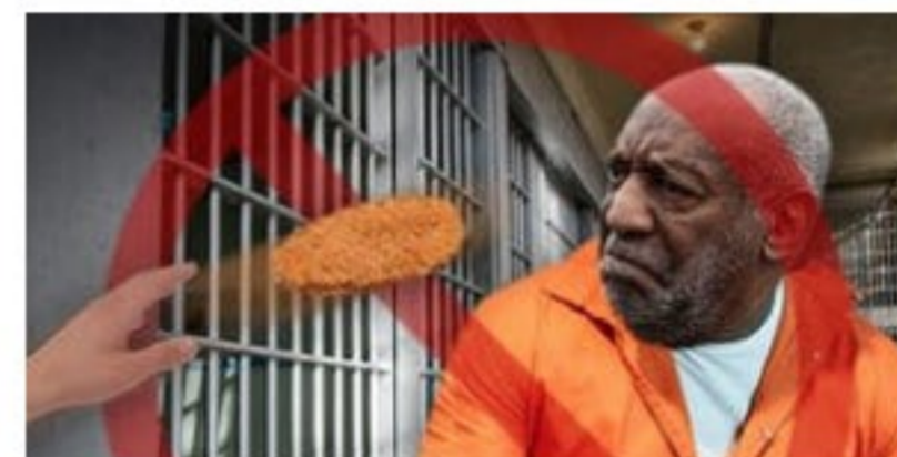
Bill Cosby Chicken Cutlet Prison Smackdown ... It Wasn't Me!!!