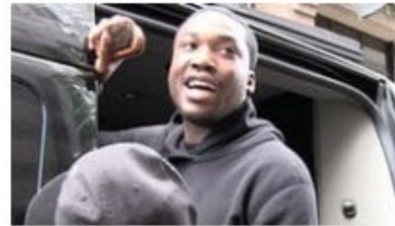
Meek Mill Renovating Basketball Court in His Old Stomping Grounds