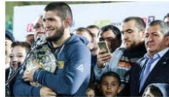
Khabib Gets Hero's Welcome In Dagestan, 'You Inspired Me!'