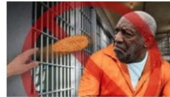
Bill Cosby Was Not Smacked in Face with Chicken Patty in Prison Food Fight